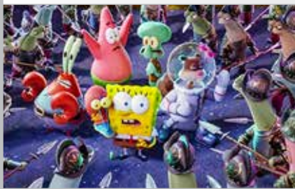
The SpongeBob Movie: Sponge on the Run. © 2020 Paramount Animation.