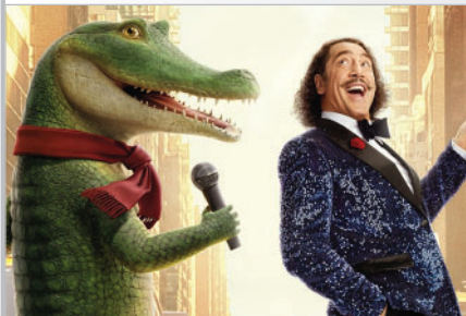
Lyle, Lyle Crocodile

LYLE, LYLE, CROCODILE Javier Bardem, Constance Wu Family CH. 516, 534